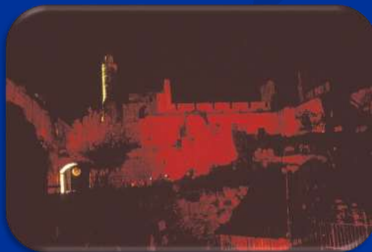
Museum Davids Tower, Jerusalem

And thou shalt eat the fruit of thine own body, the flesh of thy sons and thy daughters, which the LORD thy God hath given thee, in the siege, and in the straitness, wherewith thine enemies shall distress thee: