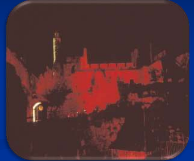
Dauids Tower Museum, Jerusalem

➤ In 70 AD, the Romans destroyed Jerusalem.