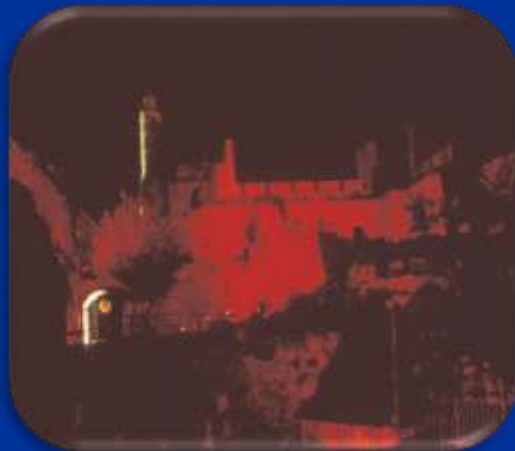
Museum Davids Tower, Jerusalem

A nation of fierce countenance, which shall not regard the person of the old, nor shew favour to the young: