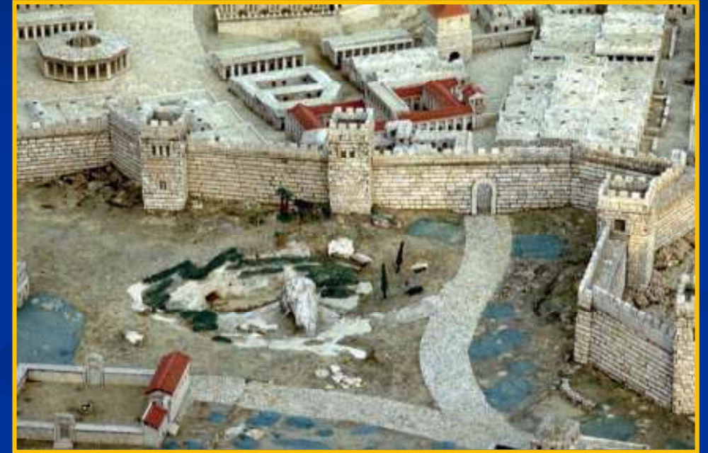
The rock of Golgotha, Jerusalem