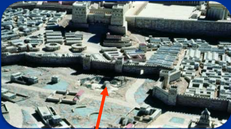
Holyland Corp. Jerusalem