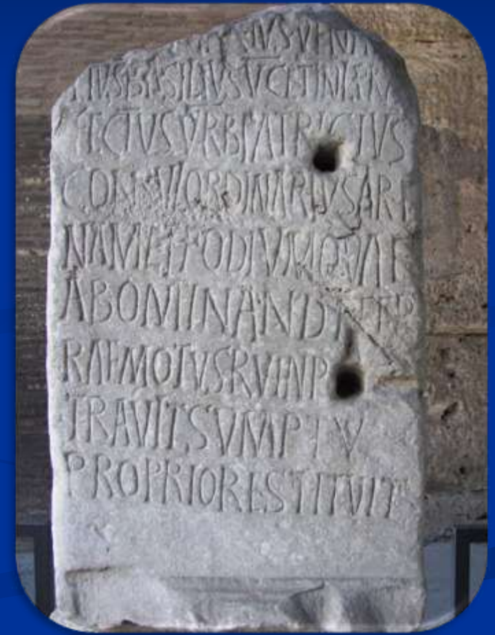
Wknight 94 GNU 1.2

The LORD shall bring a nation against thee from far, from the end of the earth, as swift as the eagle flieth; a nation whose tongue thou shall not understand;