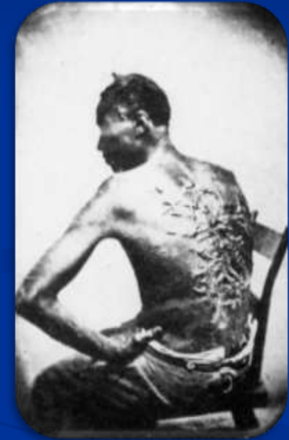
Flogged slave in America